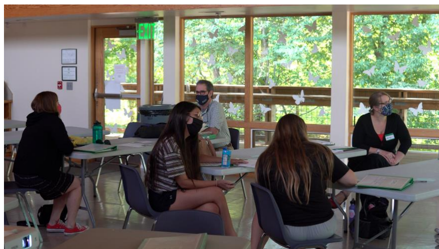
WCWLN Participants and mentors pictured during activity.