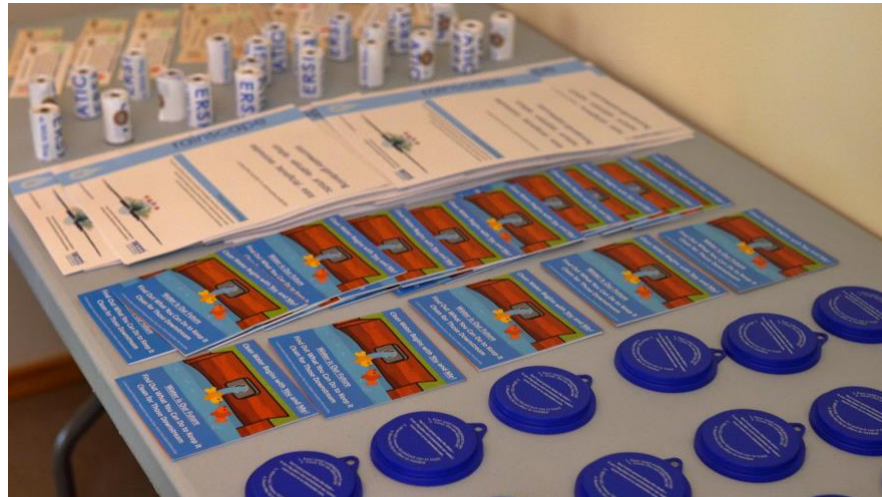
Swag Bag items include bookmarks, Rainscape packet, Clean Water Brochure, recyclable pet waste bags, and lids for disposing of fats, oils, and grease properly.